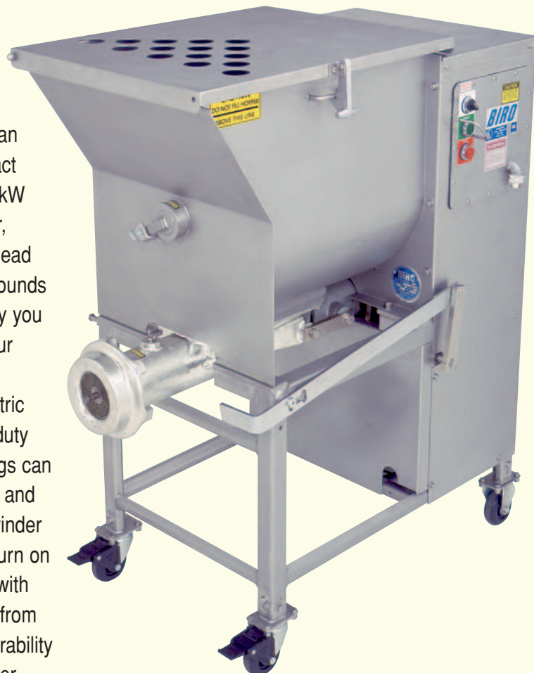
AFMG-24 SHOWN WITH OPTIONAL ADJUSTABLE LEGS WITH CASTERS

The Biro AFMG-24 Mixer Grinder is an ideal mixer grinder for today's compact supermarket meatroom. Its 5 hp/3.7 kW (7.5 hp/5.6 kW optional) auger motor, 140 lb. (64 kg) hopper, and size 32 head can give you an output of up to 68 pounds (31 kg) per minute for the productivity you need. For even more productivity, your AFMG-24 can come with an optional meat lug holder and an optional electric or pneumatic footswitch. The heavy duty stainless steel hopper, frame, and legs can stand up to years of daily washdown and still resist corrosion, so your mixer grinder lasts longer, and you get a better return on your investment. Of course, it's built with the superior engineering you expect from BIRO. Compact size coupled with durability helps the Biro AFMG-24 Mixer Grinder work harder so you don't have to.